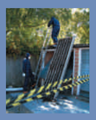
Front page pictures are examples showing where asbestos might be found.

This leaflet aims to address any concerns and questions you may have about asbestos in your home. It will explain what asbestos is, why it might be a problem, where it could be found and what Crawley Homes is doing.