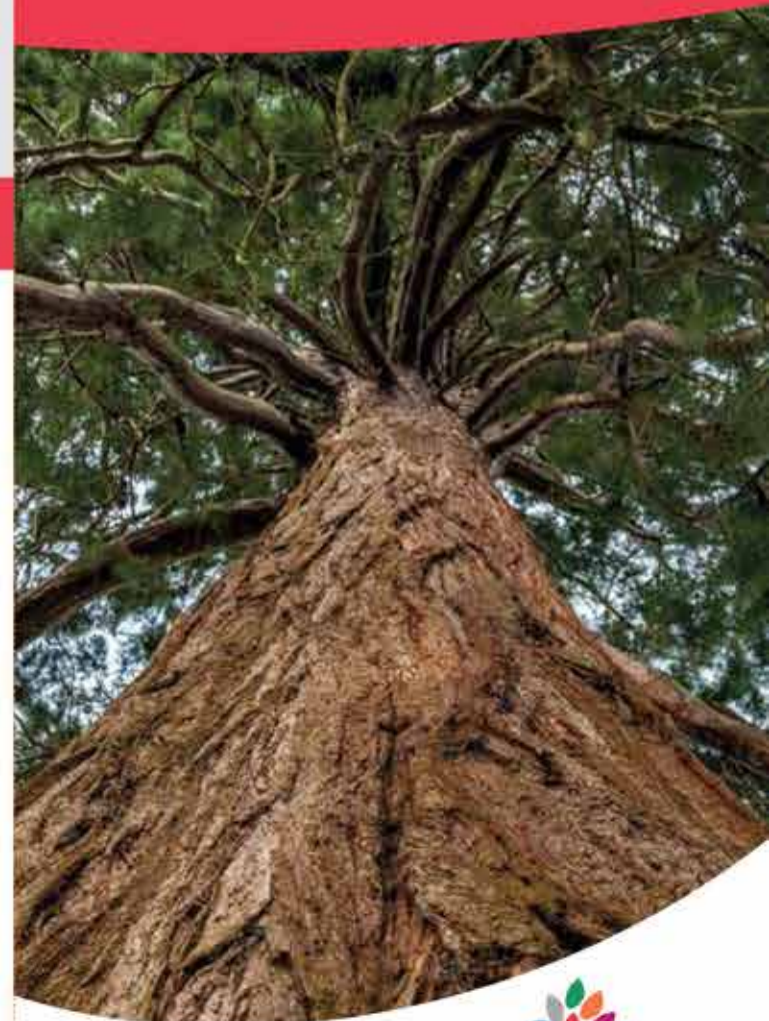
Produced by Fitzpatrick Woolmer - 01634 711 771