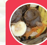
Kitchen waste such as fruit and vegetables*