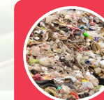
Rubbish, animal waste, cat litter, hay/straw