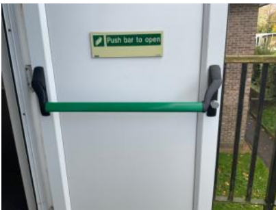
Push bar and turn to open on 1st floor fire exit.

Priority High Status Identified Due Date 20 November 2022