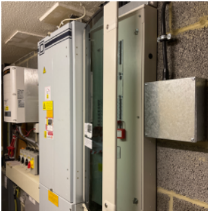
Fuse board in Electrical Room to be kept shut.